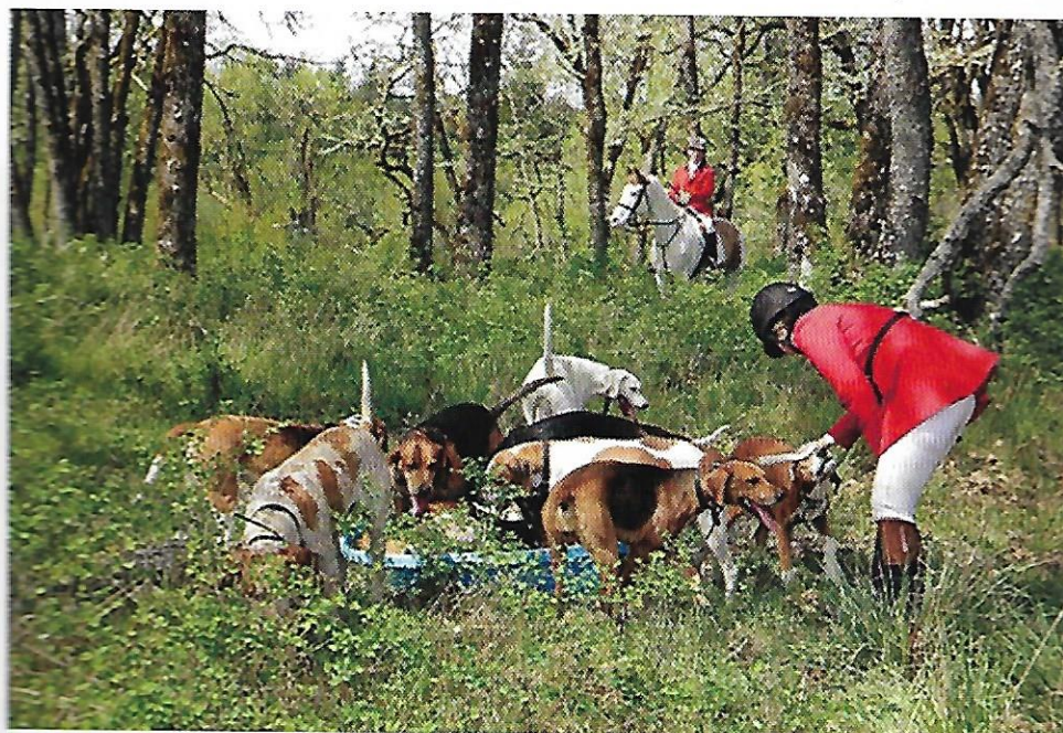
Hounds cooling off after a fast spring run.